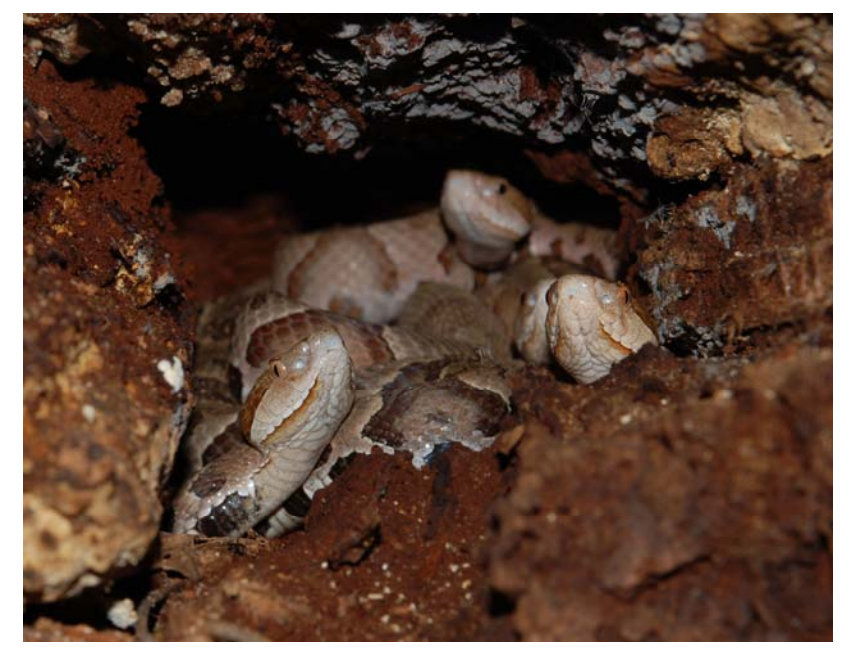
Evin T. Carter

The copperhead is found in high, dry, rocky and wellforested areas dominated by oaks and hickories. However, the Southern Copperhead can often be found in low wet areas. It can be found under and in logs, in cracks of foundations, under rocks and in deep leaf litter. Copperheads have a broad diet consisting of small rodents such as mice, lizards, amphibians and large insects. This species is secretive and tends to avoid areas with a lot of human activity. The copperhead is active at night during the warmest part of the year and is